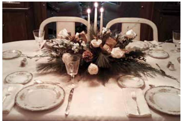
Pictured is the antique Owen family china, monogrammed stemware from Edith Owen and silverware from Pam's parents.

Table Setting – An Owen family tradition is to set the holiday table with china place settings from past generations, along with stemware and serving dishes. This creates an atmosphere of loving remembrance. It is also comforting to prepare some of your loved one's favorite dishes and serve at a holiday dinner.